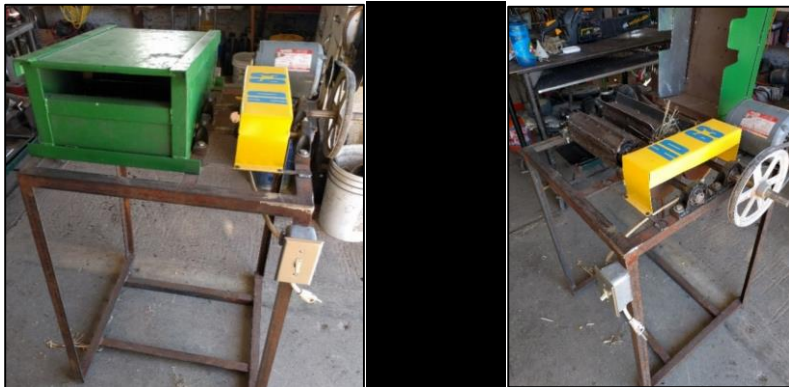
Image 1. Custom built decorticator, Alburgh, VT, 2017.

On 24-Jun, plant populations were recorded by counting the number of plants in a foot-long section of the row, two times per plot. Prior to mowing, five randomly selected plant heights and stem diameters were recorded on 16-Aug within each plot. Additionally, on the same day, wet weight harvest yields were calculated by sampling the hemp biomass within a 0.25 m 2 quadrat. Harvest moisture was calculated by taking a subsample of hemp biomass and drying it at 105° F until it reached a stable weight. On 17-Aug, five plants were selected at random from each plot and run through a custom-built decorticator (Image 1). While the stalks were still fresh, they were weighed and decorticated to separate the bast and hurd fibers. As the stalks passed between the two moving gears, hurd fiber broke away and dropped to a bucket placed underneath. The bast and hurd were weighed to determined varietal differences.