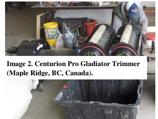
Image 2. Centurion Pro Gladiator Trimmer (Maple Ridge, BC, Canada).

Autoflower varieties are included for comparison with full season plants in the variety trial. Each was evaluated using similar metrics and received similar field preparation to those grown within the variety trial. Spacing for autoflower varieties was reduced to 2’ and were similarly planted into irrigated black plastic. Autoflower varieties ‘Auto Ceiba,’ ‘Early Bird 1,’ and ‘Early Bird 2’ are included for comparison, but were not included for statistical comparison due to unique growth habit.